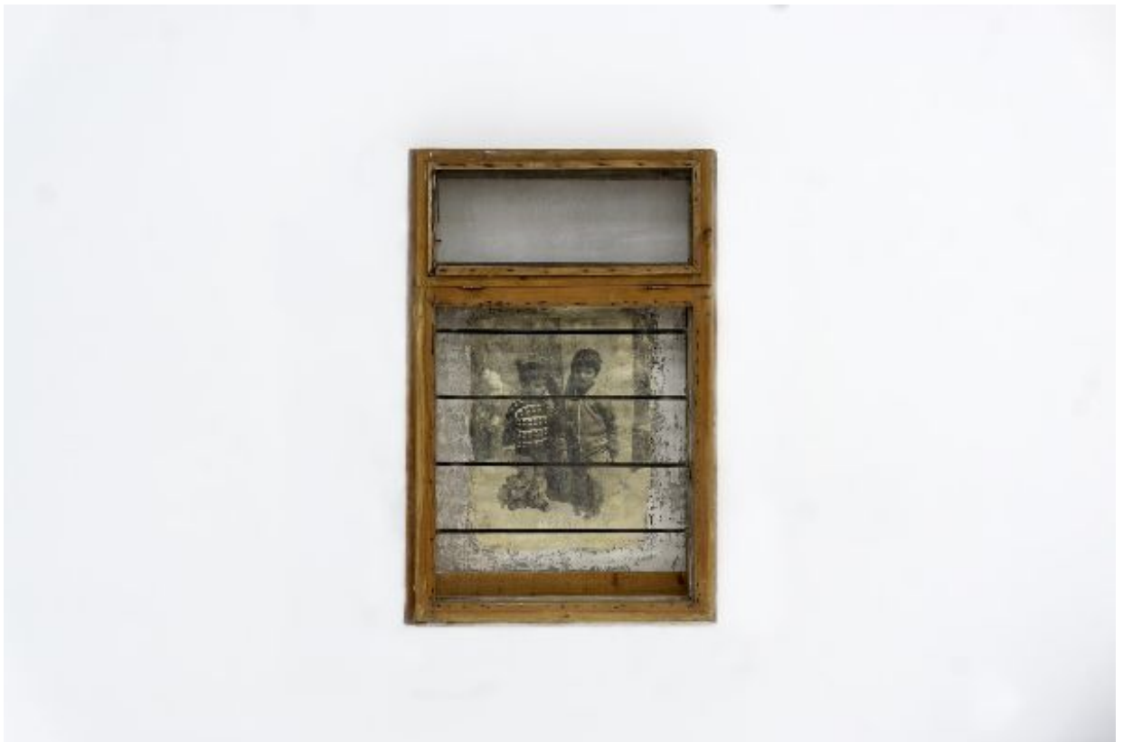
Central image: Nan Goldin, All by Myself, 1995-1996, EMΣT Collection